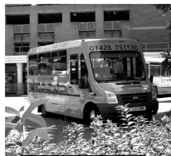
Hospital bus leaves Andover

Without warning, Winchester and Eastleigh NHS Trust have scrapped the regular Andover to Winchester hospital bus to save money. The service, introduced after pressure from Andover's Lib Dem councillors, stops on 31st August.