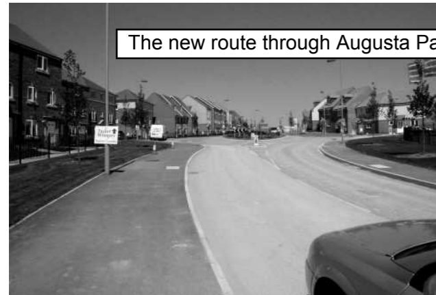
The new route through Augusta Park