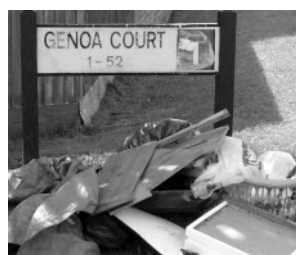
Flytipped rubbish cleared

Over the spring and summer your local Focus team has been out and about in Alamein ward dealing with the issues and problems you have raised. During this time we have -