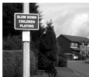
Traffic calming introduced