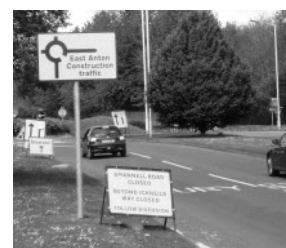
Road signs improved