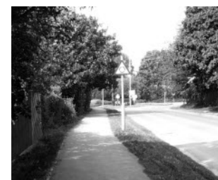
Overhanging trees cut