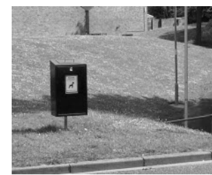
New dogbins installed